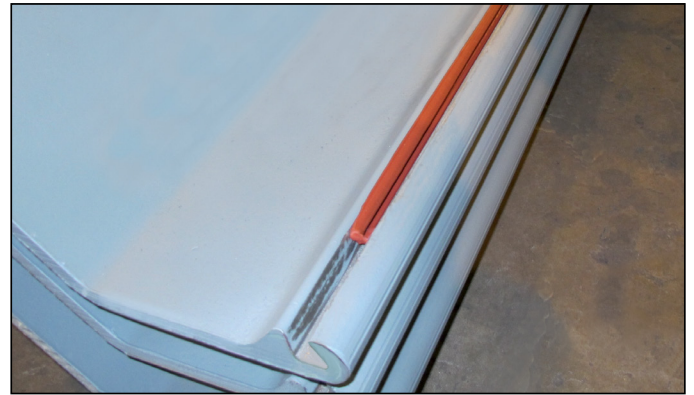
AKILA system: MSP-1 product extruded into the interlock